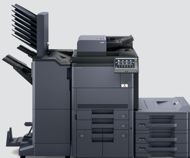
Configuration with PF-730+PF-7130+DF-7110+MT-730+BF-730