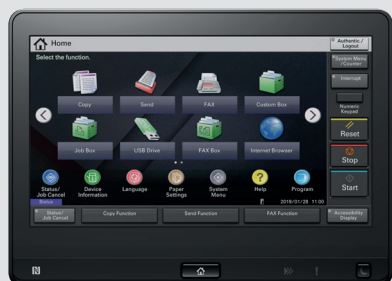
10.1" Colour Touch-screen , tiltable